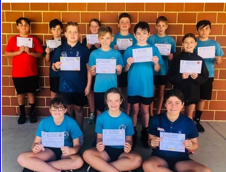
TA12, TA13, TA10, TA11 & Indonesian