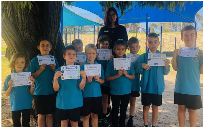
TA1, TA2, TA3 & TA4