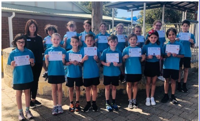
TA6, TA7, TA8, TA9, Music, Indonesian & Health