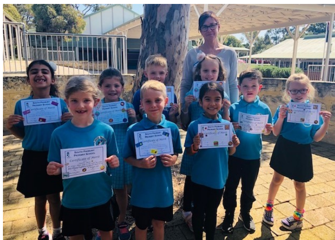
Year 1 & Year 2