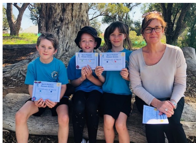
Year 4 TA8